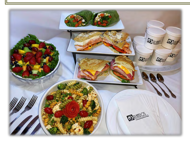
Picture is just an example of service - all items come on black round disposable trays & clear bowls

Sun Dried Tomato Oregano Pasta Primavera Salad Broccoli & Cheddar Macaroni Salad