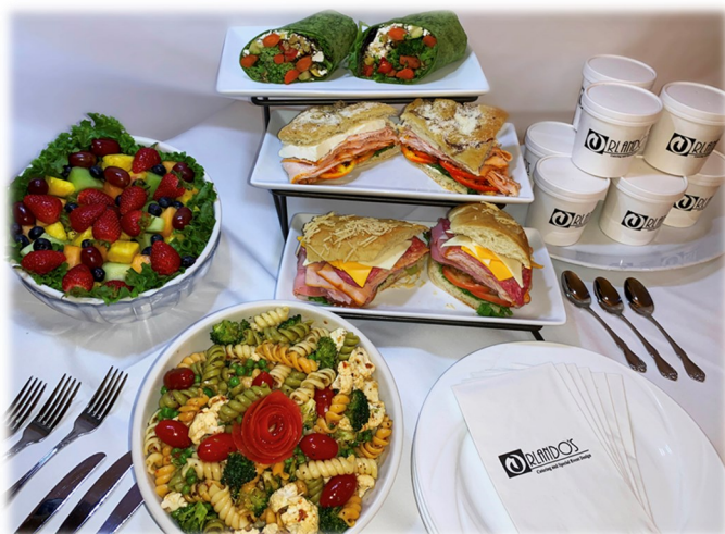
Picture is just an example of service - all items come on black round disposable trays & clear bowls

Sun Dried Tomato Oregano Pasta Primavera Salad Broccoli & Cheddar Macaroni Salad